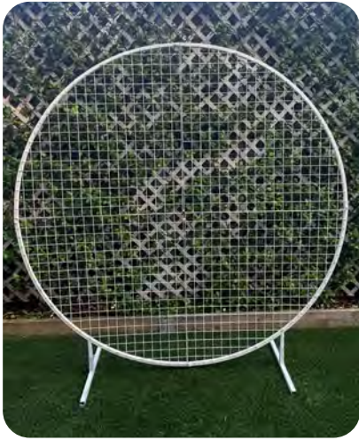
BACKDROP - WHITE