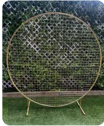
BACKDROP - GOLD